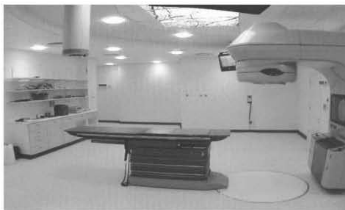
LINEAR ACCELERATOR, COLNEY CENTRE NNUH

As for the radiographers, there is only an "A Team" – they really know what they are doing!